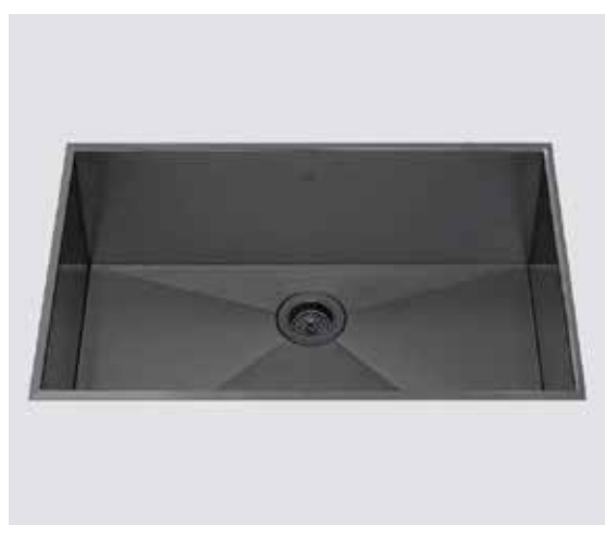
*Flush-Mount Installation Kit is included with each sink *Custom ADA compliant versions are available