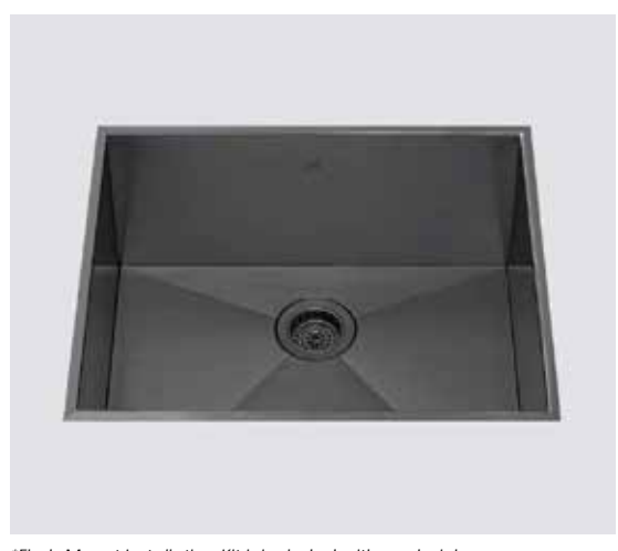
*Flush-Mount Installation Kit is included with each sink *Custom ADA compliant versions are available