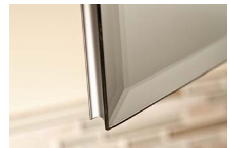
Beveled Mirror Section View