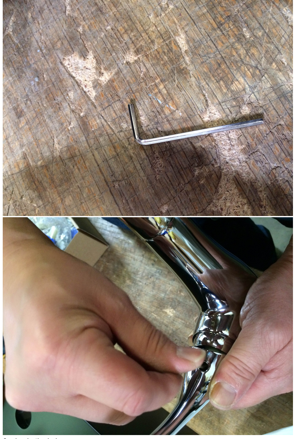
6. plug in the hole cover

Please advise if you have questions of the procedure.