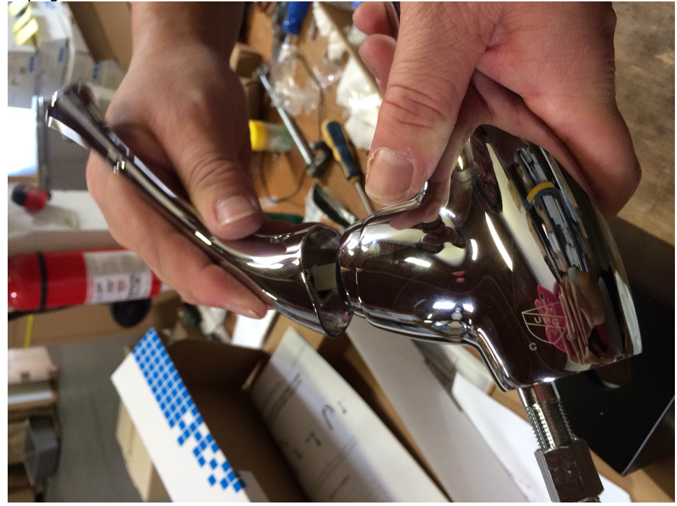
5. use the below tool the twist screw inside the hole