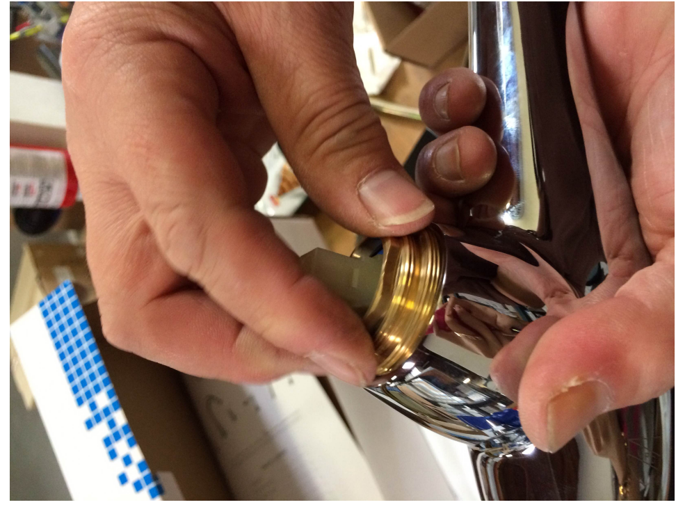
3. twist the silver vover on the gold ring